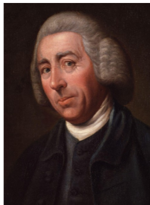
Capability Brown, Nathaniel Dance, c.1773