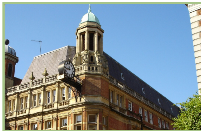
Museumofrichmond Facebook profile picture

The museum now has a profile on Trip Advisor . This is an important way that national and international tourists can hear about the museum. Currently we are not ranked very highly against other attractions in Richmond (#25 of 31 things to do in Richmond), but after a few more reviews this should improve. If you have enjoyed a recent visit why not give us a review. Search for the museum at www.tripadvisor.co.uk .