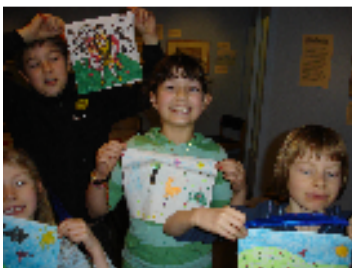
Some 'Swanky Hankies' during February half term

It has been a busy term for families. During February half term, we had a week of well-attended Swanky Hanky Workshops . Looking at the souvenir handkerchiefs in the Museum collection, attendees designed and made their very own celebratory handkerchief. Over the Easter break, activities included tile painting and story board drawing.