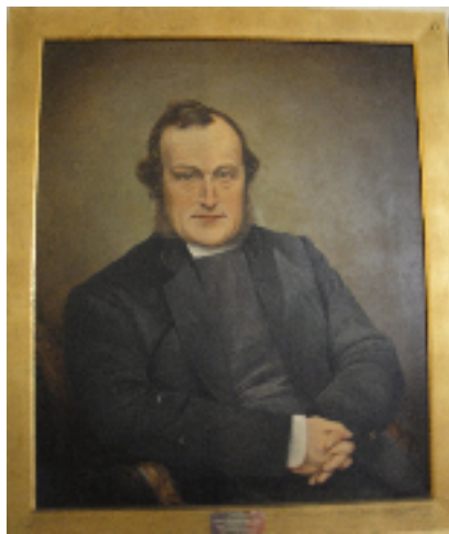
Portrait of George Augustus Selwyn, Dunedin Cathedral, New Zealand

Spending the month of January in New Zealand, I was constantly reminded of Richmond's history by encountering, in three cities, Auckland, Christchurch and Dunedin, an illustrious member of the Selwyn family, George Augustus Selwyn, first and only Bishop of New Zealand.